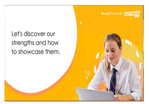
Essential Skills with Thales Volunteers - Skills and Strengths