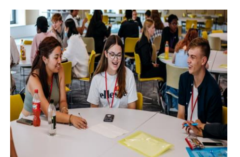
Experience University of Southampton Residential- 18<sup>th</sup> – 21<sup>st</sup> July 2023